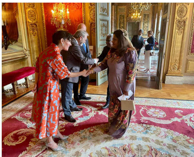
Ambassador Geela attends Belgium National Day reception hosted by at the Egmont Palace

The Ambassadors also discussed the cooperation between the two countries including the signature of the economic cooperation agreement. Ambassador Geela also thanked Hungary's contribution towards the socio-economic development of Maldives, highlighting the scholarships provided annually by Hungary. Ambassador Kovács reassured Hungary's commitment to enhance cooperation with Maldives.