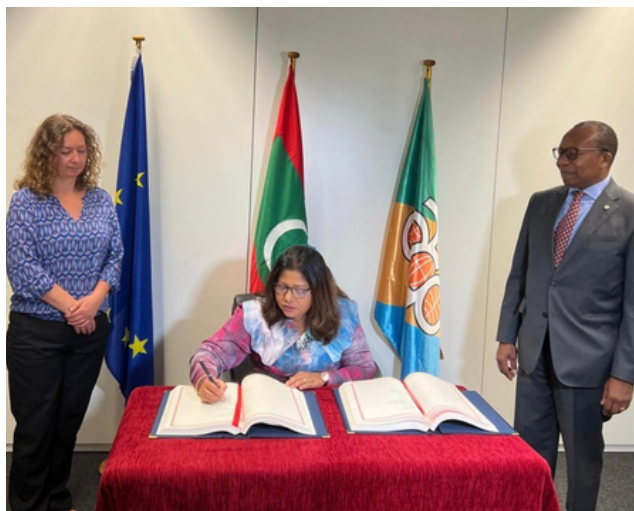
Maldives signs the “Samoa Agreement”