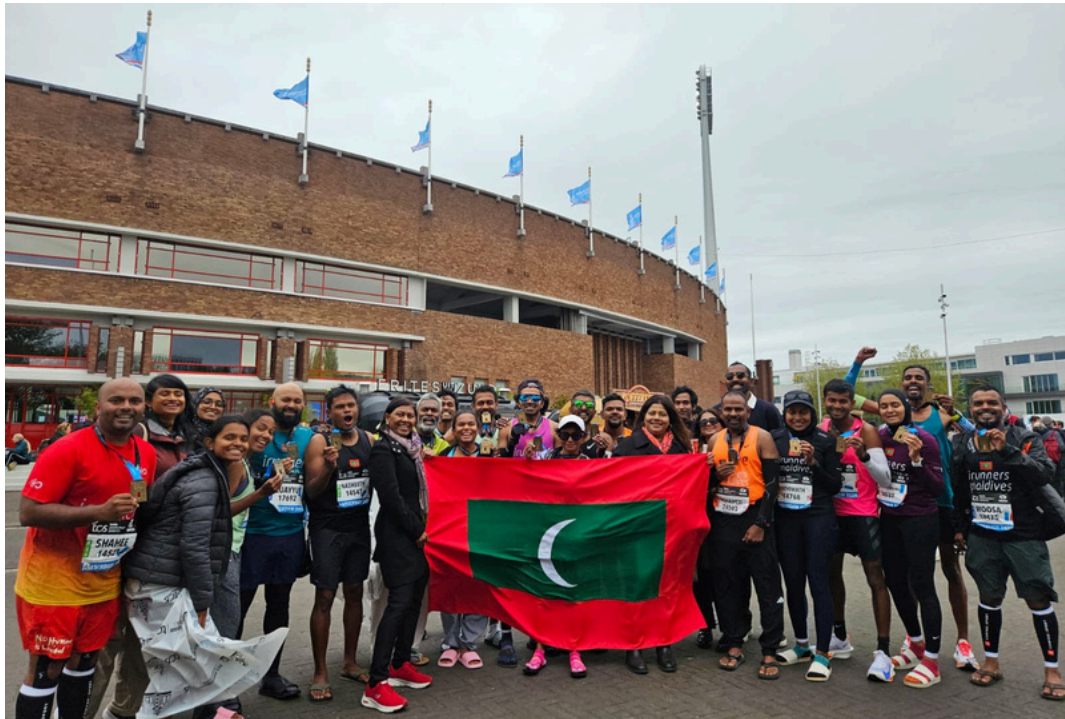
The Embassy congratulates all the runners from the Maldives who participated in the TCS Amsterdam Marathon